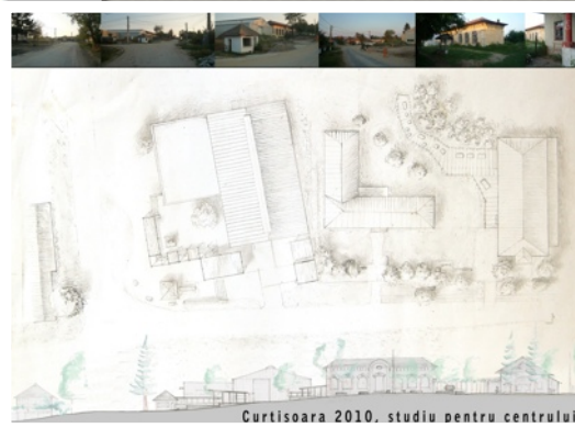
FOURTH SUMMER WORKSHOP WITH STUDENTS FROM ROMANIA, BELGIUM AND FRANCE